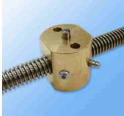
Assembled LB support